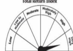
Scheme Benchmark: Nifty MidSmallcap400 Momentum Quality 100 Total Return Index

Investors understand that their principal will be at Very High Risk