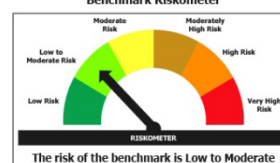
Scheme Benchmark: (As per AMFI Tier 1 Benchmark) Nifty Liquid Index A-I Benchmark Riskometer