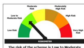
Scheme Benchmark: (As per AMFI Tier 1 Benchmark) Nifty Liquid Index A-I Benchmark Riskometer